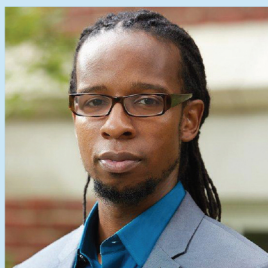
CARTER G. WOODSON FRIDAY LUNCHEON Ibram X. Kendi Winner, National Book Award Non-Fiction