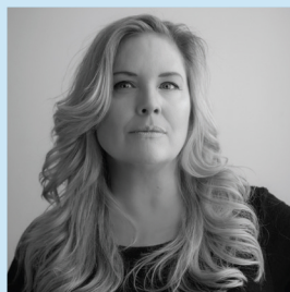
CARTER G. WOODSON FRIDAY LUNCHEON Heather Ann Thompson Winner, Pulitzer Prize