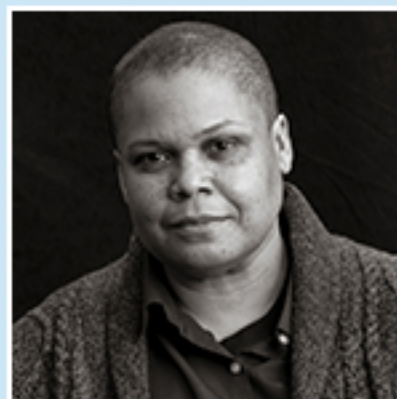
KEEANGA-YAMAHTTA TAYLOR, PRINCETON UNIVERSITY