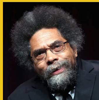
CORNEL WEST Discussant