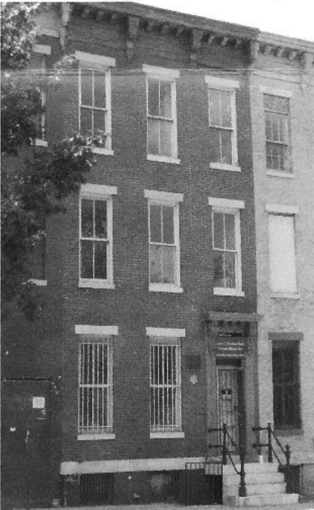
Carter G. Woodson's Home at 1538 9th Street NW, photographed in 2006 before restoration.