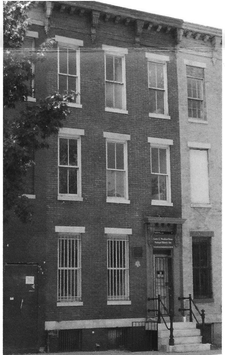
Carter G. Woodson's Home at 1538 9th Street NW, photographed in 2006 before restoration.

A. Yes. The house is available for tours Friday – Sunday, 10 a.m. – 3:30 p.m. Call 202-690-2525 for reservations.