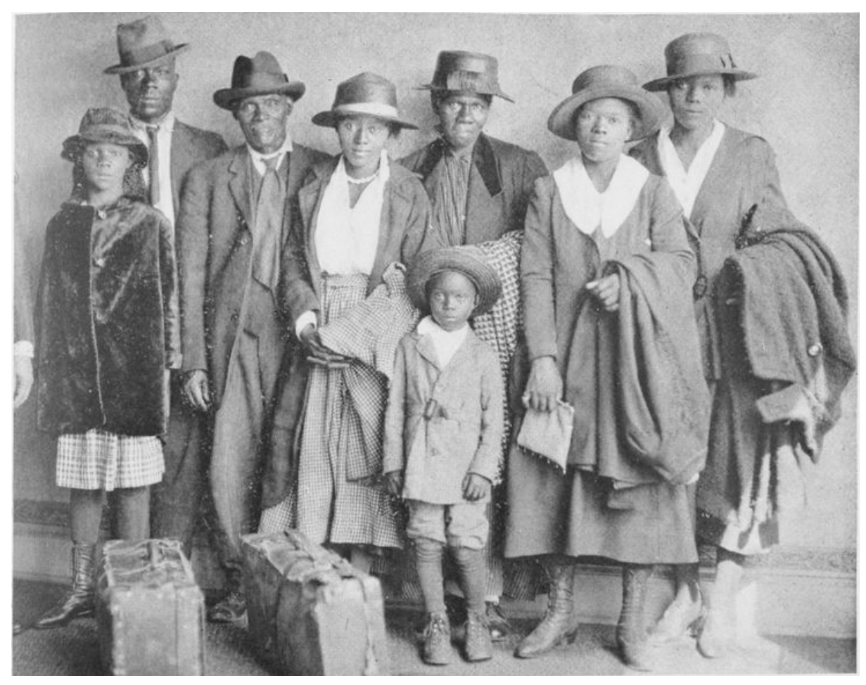
"A Negro family just arrived in Chicago from the rural south."

https://digitalcollections.nypl.org/items/510d47de-1a10-a3d9-e040-e00a18064a99