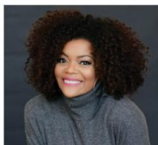
YVETTE NICOLE BROWN Emmy Nominated Actress, Writer & Singer