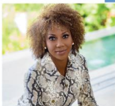
HOLLY ROBINSON PEETE Actor, Author, Philanthropist