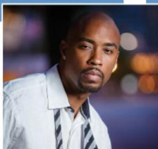
MONTPELL JORDAN Singer, Songwriter, Musician & Minister