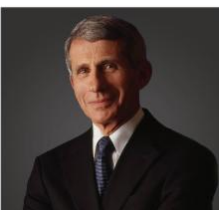
ANTHONY S. FAUCI, MD Director, National Institute of Allergy and Infectious Diseases National Institutes of Health