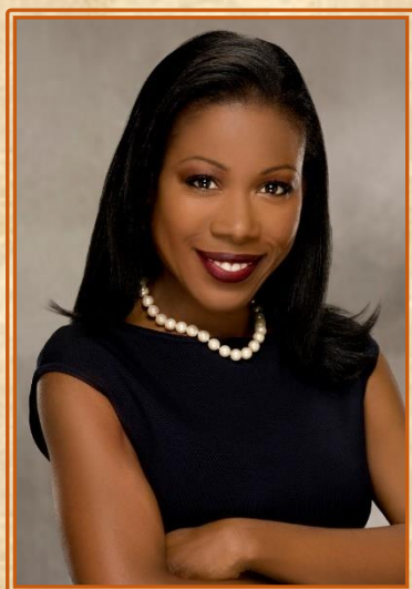
Isabel Wilkerson, Author

ASALH will discuss this major literary event by Pulitzer Prize Winner Isabel Wilkerson for her 2020 Book: 'Caste: The Origins of Our Discontents'