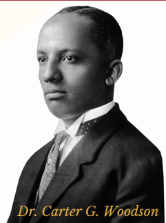
Dr. Carter G. Woodson