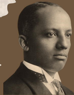
Dr. Carter G. Woodson